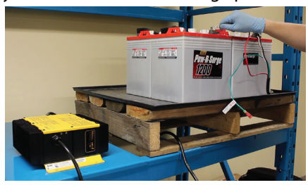
Figure 7: Touch the positive lead to the positive battery terminal for 3 seconds.