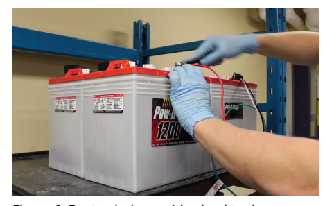
Figure 8: Reattach the positive lead to the positive terminal after disconnecting AC power.